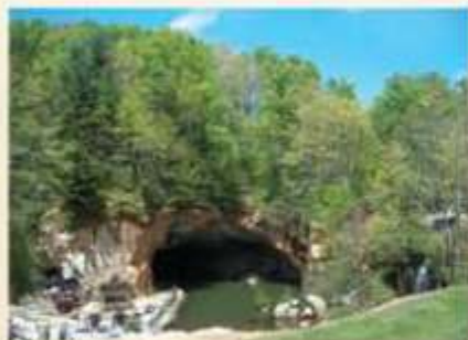
Emerald Village - An authentic mine with mining museum, gold and gem panning, and special events.