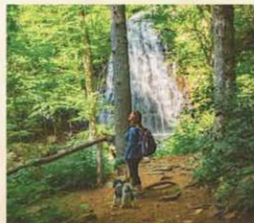
Crabtree Falls a scenic 2.5- mile loop trail, located just off the Blue Ridge Parkway