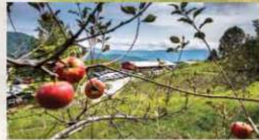
The Orchard at Altapass on the Blue Ridge Parkway.

In LSD (Little Switzerland Downtown), the Switzerland General Store is packed with items ranging from their signature BBQ sauce, rubs, dips, picnic items, beers and wines to specialty casual wear and pottery. Next door at Books and Beans, browse a wide selection of books or enjoy an espresso. Check their Facebook page for details.